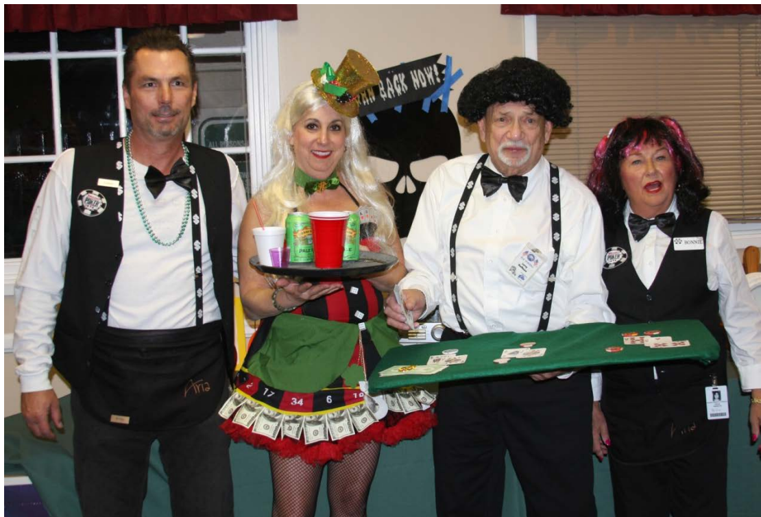
Best Group Costume... "The Blackjack Pit"