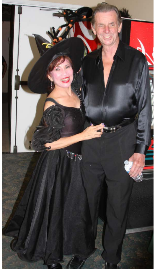
Halloween Campout & Rally 2012