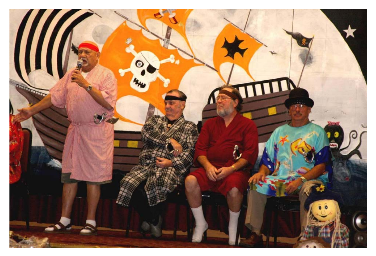
The Samurais... (L-R) Gotta Da Yen, Why I Itchi, Ti Nee Dong, and Hootchi Kootchi.