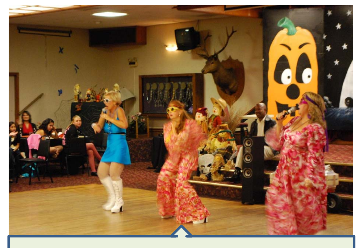
The "Dancing Queens" set the evening's frivolous tone