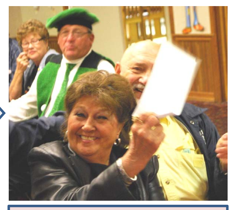
A fugitive and "Working Girl" from Harbor Blvd.