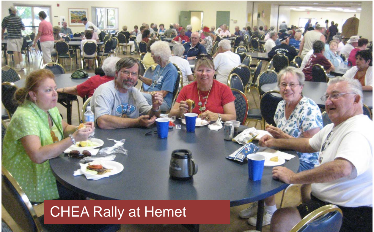
CHEA Rally at Hemet