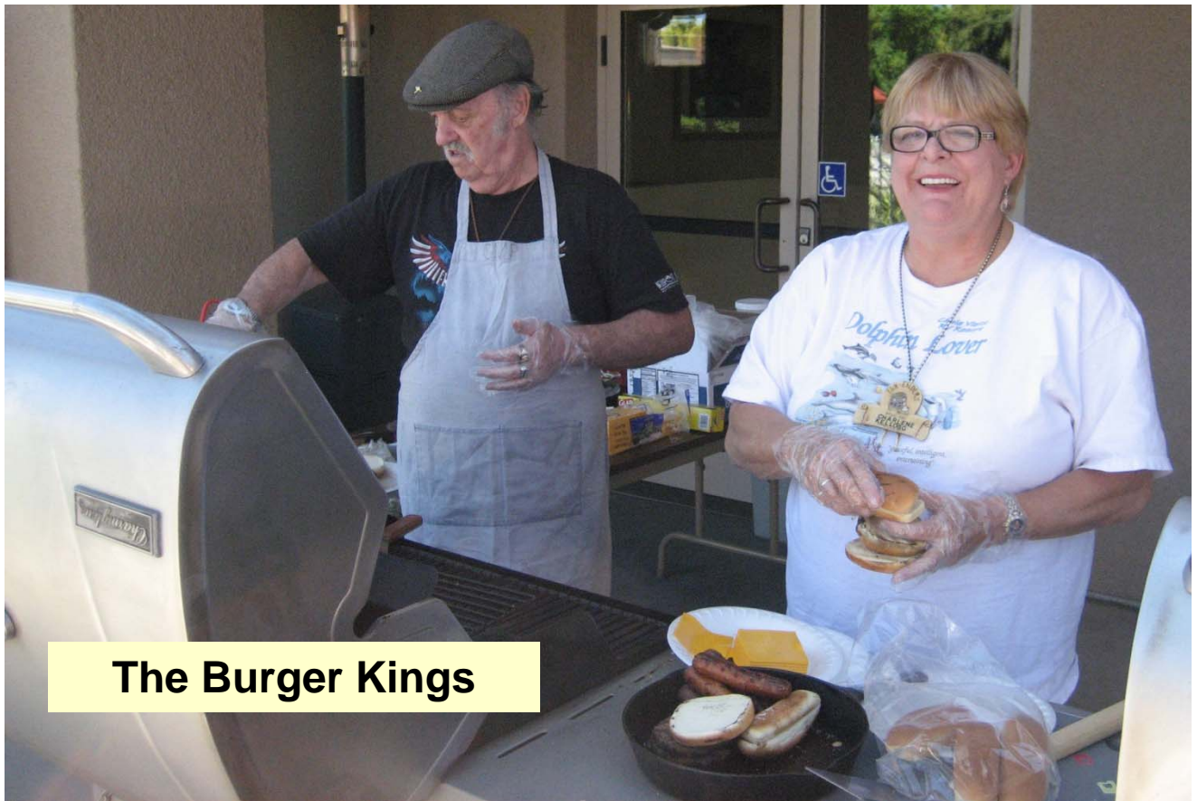
The Burger Kings