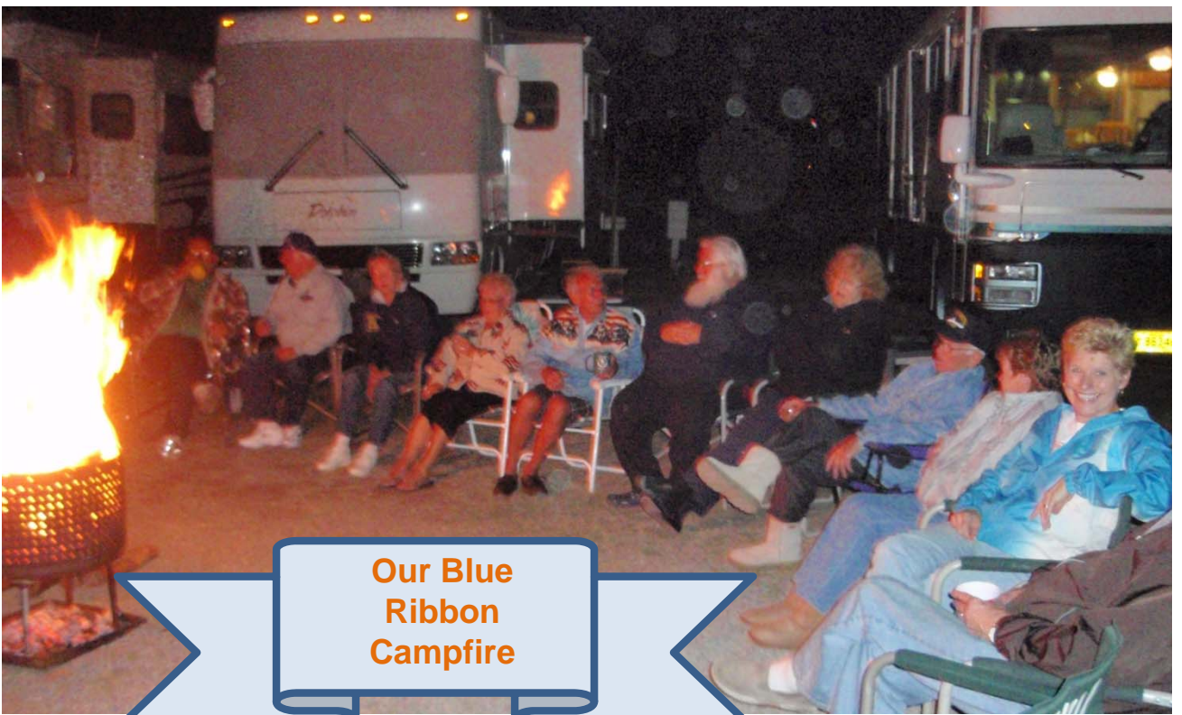
Our Blue Ribbon Campfire

Loading-up to go to the Wineries and..... Get Loaded!