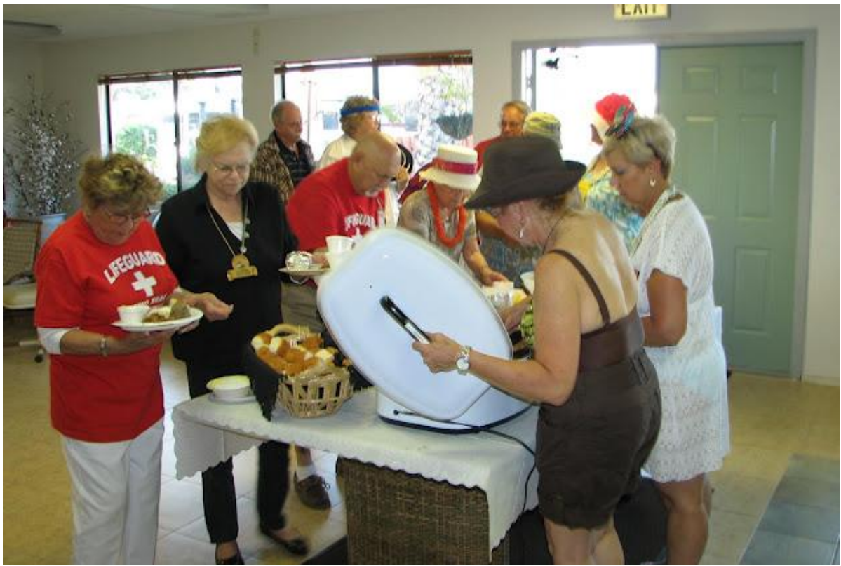
Oceanside RV Park May, 2012