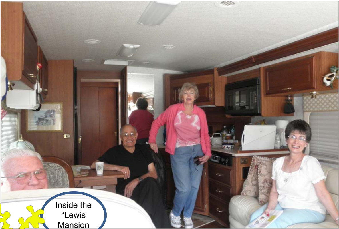
Inside the "Lewis Mansion