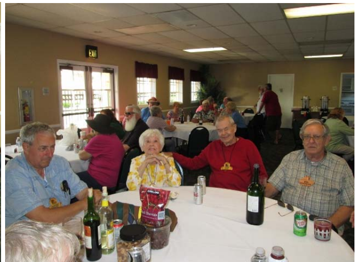
“Roughing it” at Newport Dunes – Friends, Fun, and Food!