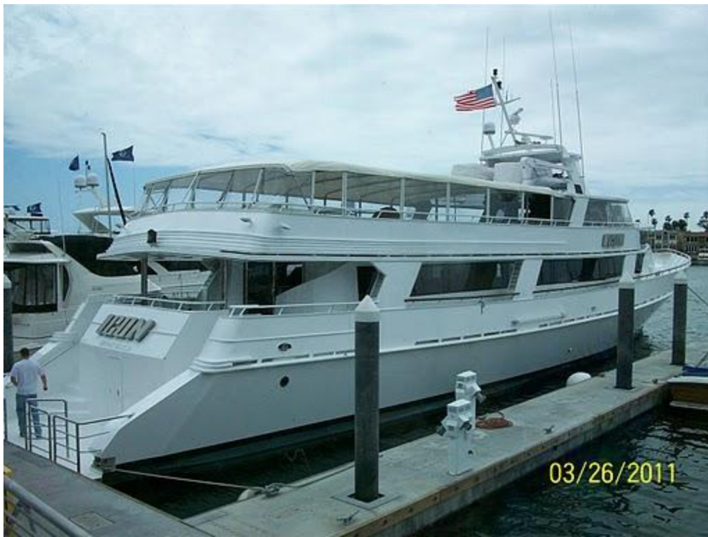
Above: The cruise ship before the Elk-Enders boarded. Below: It looks like a full house ready for the dinner.