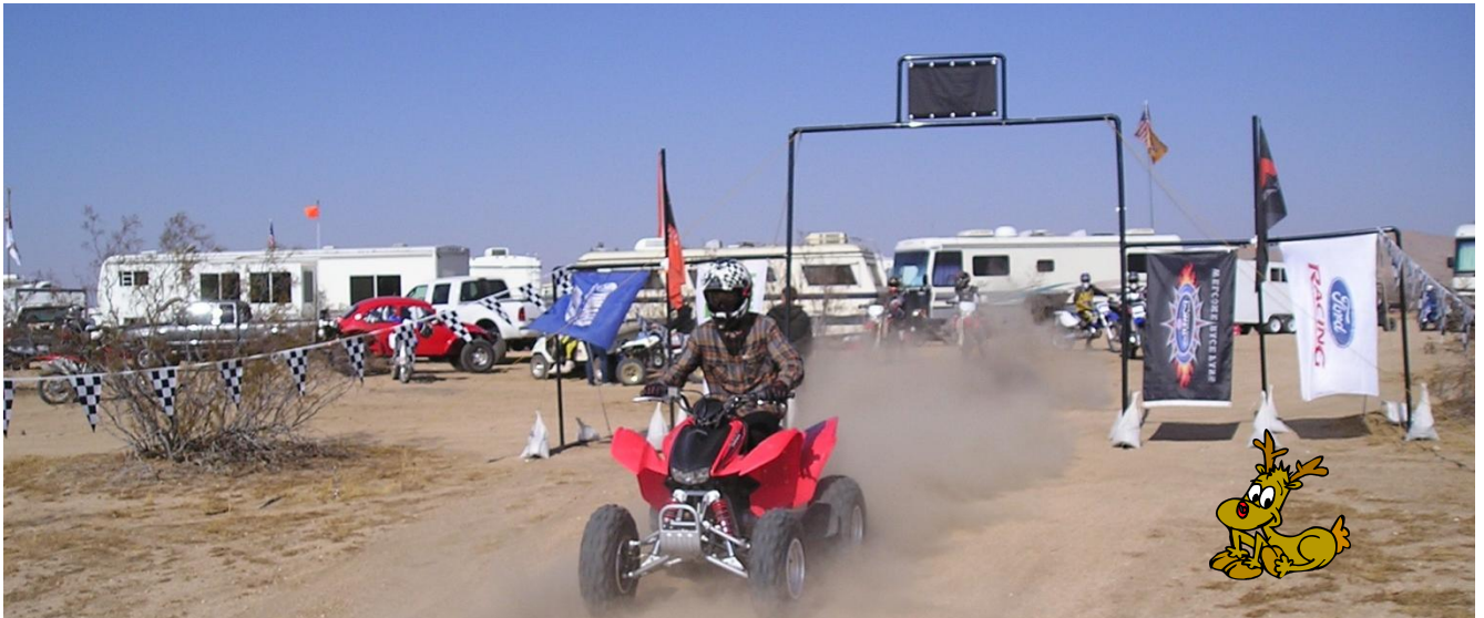
The fun begins when you go through the starting gate