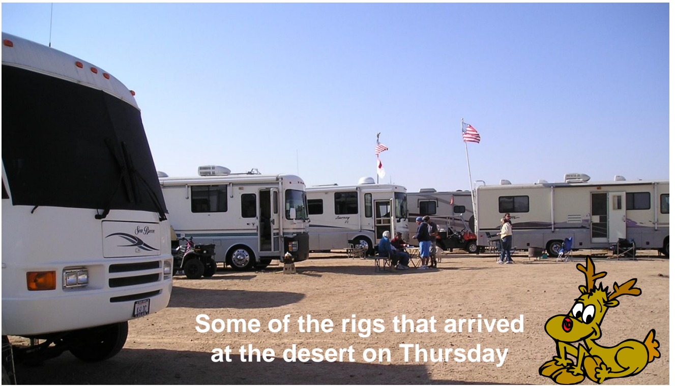
Some of the rigs that arrived at the desert on Thursday