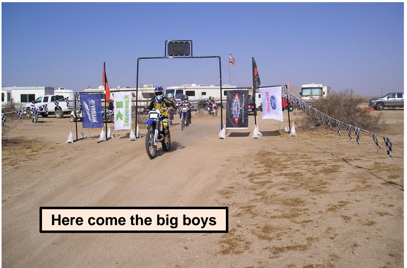
Here come the big boys

It was tough out there! For a few minutes we thought we were low on ice cubes.