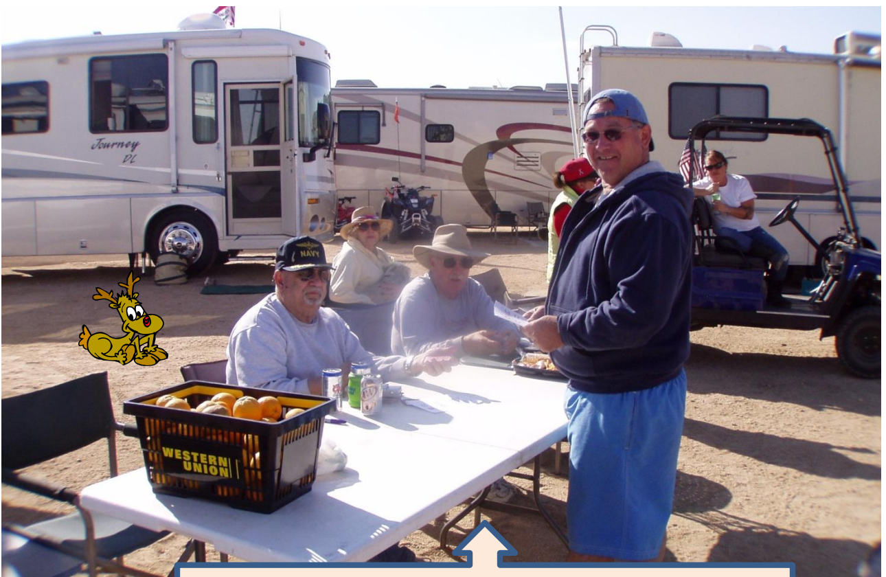
Buying the entry into the Poker-Run